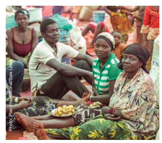
▲ Helping refugees from Burundi on their journey to safety Plan UK Trustees' Annual Report 2015

This year, we also supported refugees fleeing conflict in Burundi and Cameroon, with projects including sanitation, child protection and education.