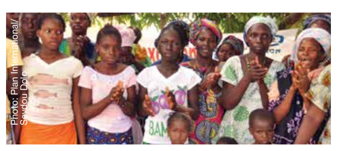
▲ Singing and dancing together to celebrate the end of FGM in their village

Plan UK Girls Fund projects help us to achieve our Because I am a Girl campaign aims by keeping girls safe from harmful traditional practices such as FGM and child marriage. In Mali, harmful traditional practices, particularly FGM, are widespread: 89 per cent of women have been cut. We're changing attitudes and transforming lives in 160 villages, helping communities to understand the dangers of FGM and encouraging them to formally renounce the practice. Across eight project areas, 92 per cent of mothers and 90 per cent of fathers now wouldn't subject their daughters to FGM.